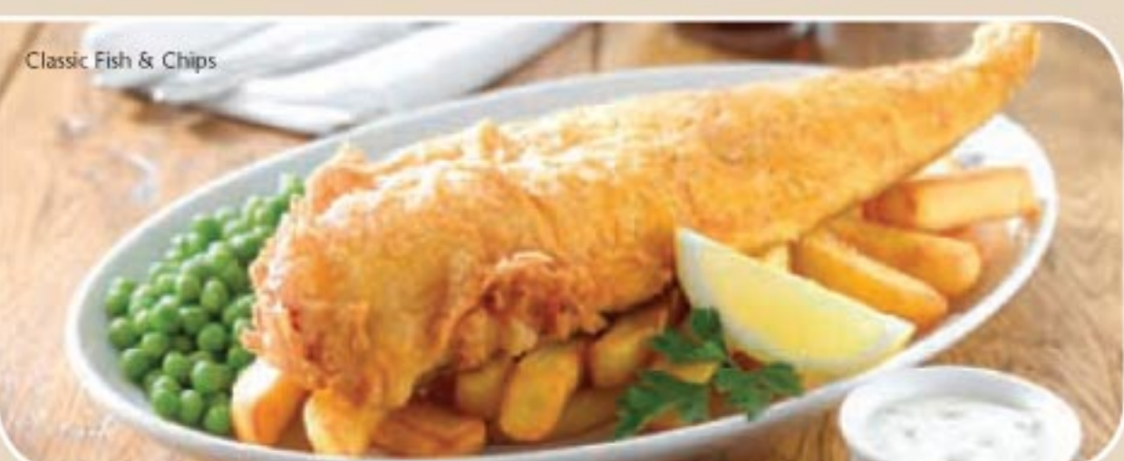
Classic Fish & Chips

Thursday Curry and a Drink only £4.99 from 5pm