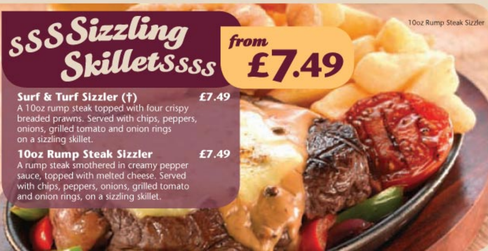
10oz Rump Steak Sizzler