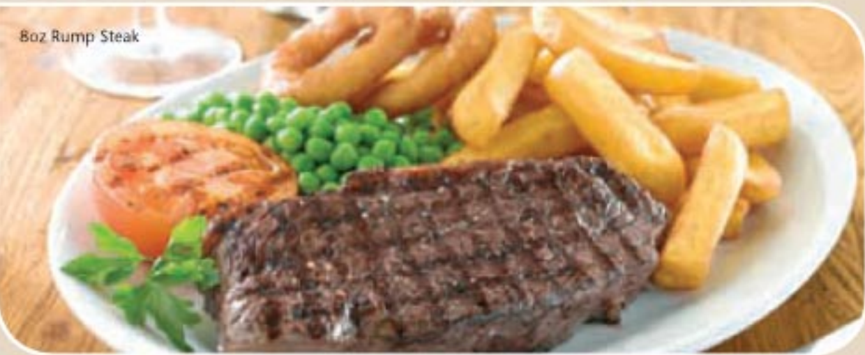
Boz Rump Steak