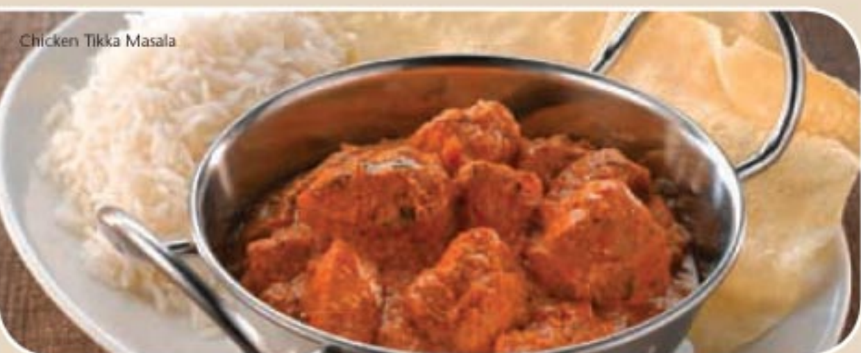
Chicken Tikka Masala

Monday & Tuesday 8oz Steak and a Drink for £5.49 from 5pm