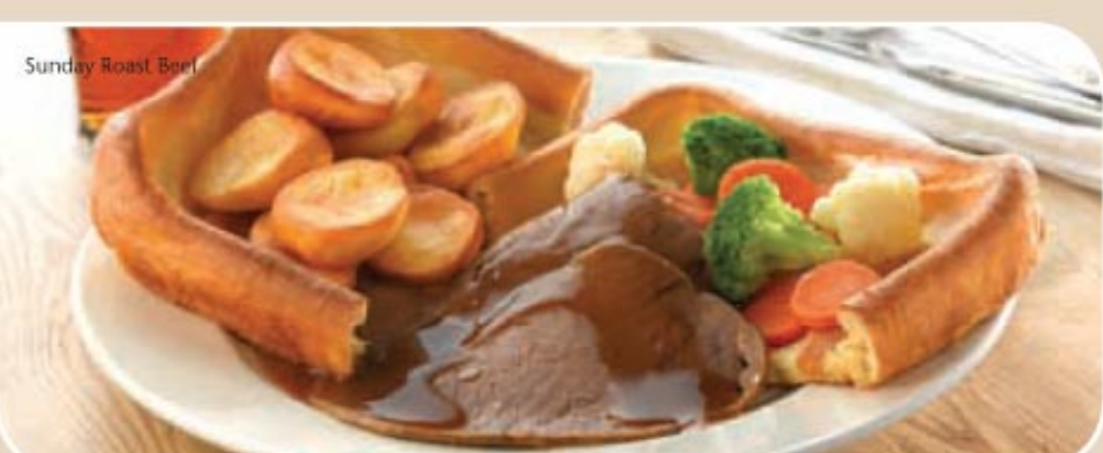
Sunday Roast Beef

Friday All Day 2 Classic Fish and Chips for £6.99