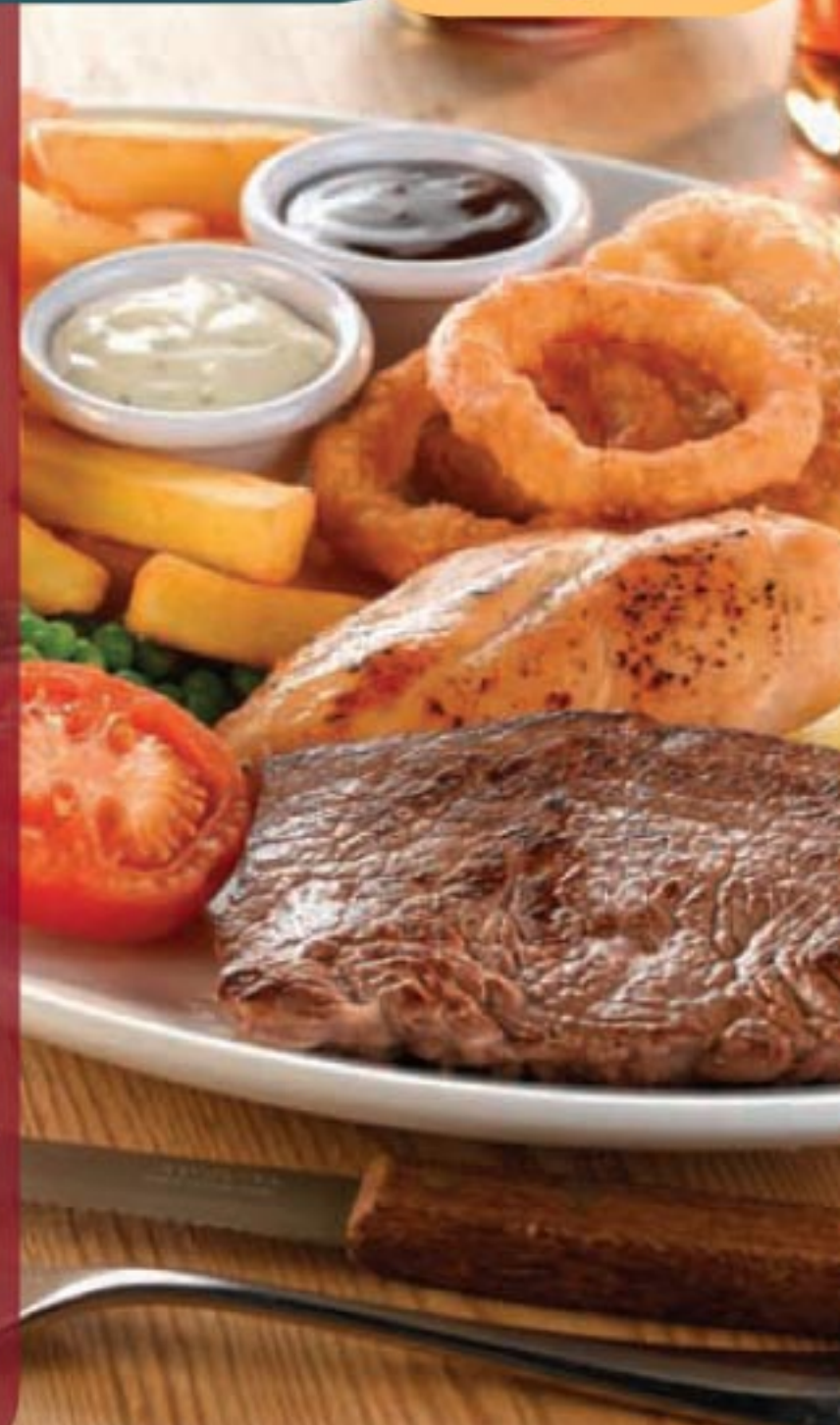
The Ultimate Surf, Turf & Cluck